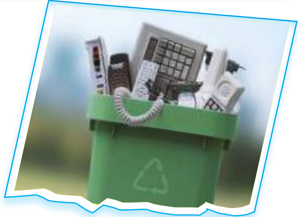
Dispose of electronic items responsibly through recycling and proper management to mitigate environmental harm.