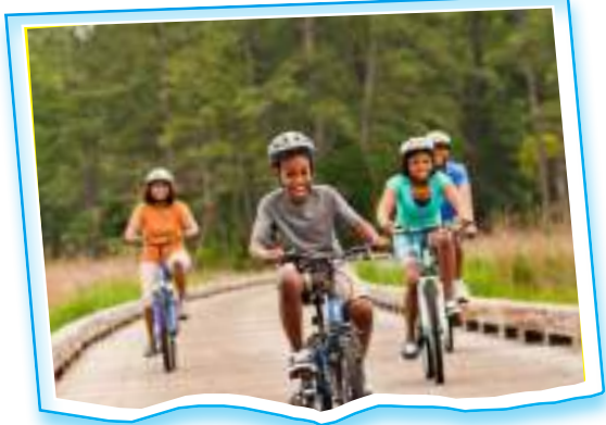
Shift to eco-friendly daily habits that support both personal well-being and environmental health.