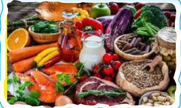
Embrace locally sourced, nutritious, and eco-friendly food choices to build a resilient food system.