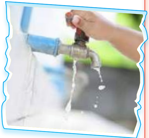
Use water wisely and implement practices that preserve this essential resource.