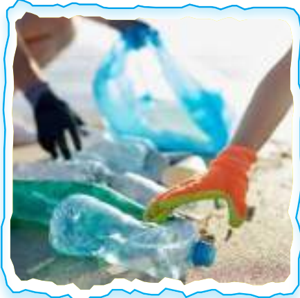
Cut down on single-use plastics to lessen pollution and protect natural ecosystems.