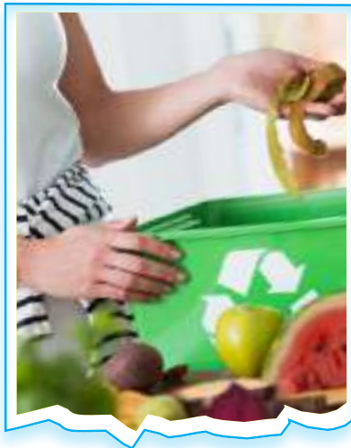
Reduce, reuse, and recycle to minimize waste and maintain a cleaner environment.