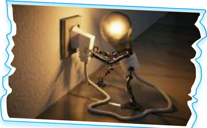
Conserve energy by adopting efficient practices and renewable solutions to lower your carbon foot print.